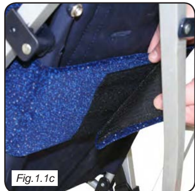
View on 'B'