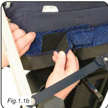
View on 'A'