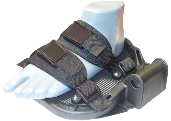
Standard Comfort Pads used in conjunction with POZIFORM® Foot Straps.