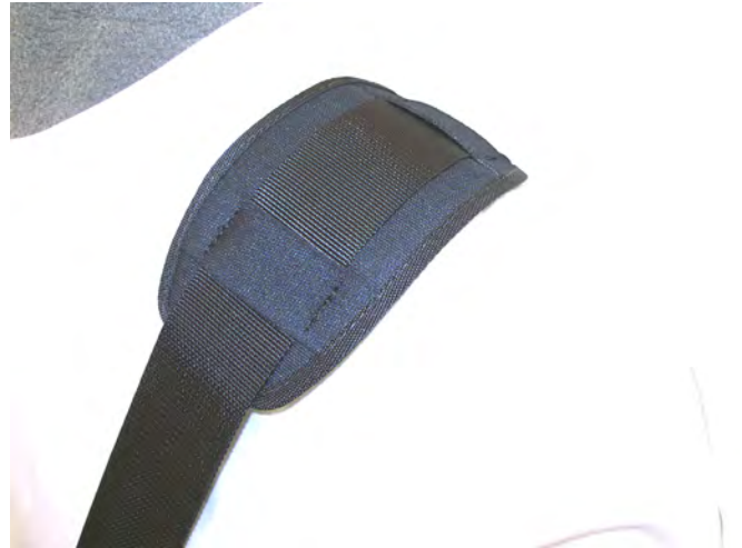
Standard Comfort Pad used as a shoulder pad on a holdall shoulder strap.