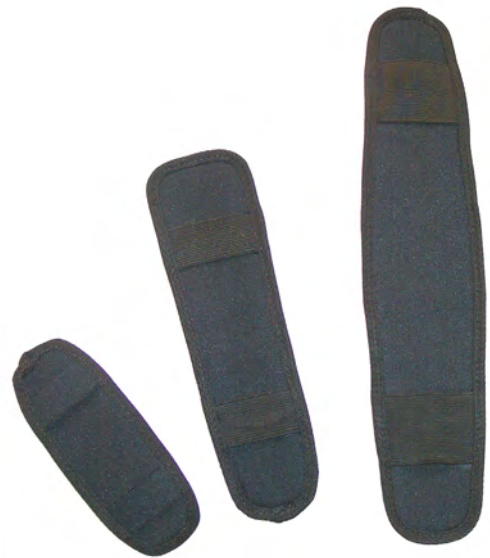
Comfort Pad Range