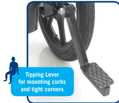
Tipping Lever for mounting curbs and tight corners