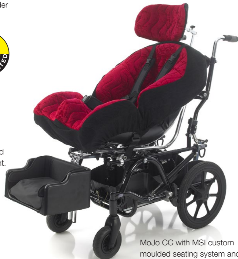
MoJo CC with MSI custom moulded seating system and padded footbox